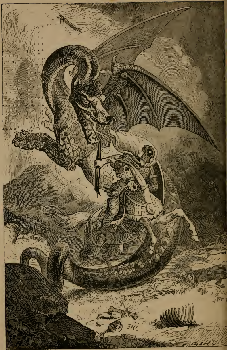
St. George of England.